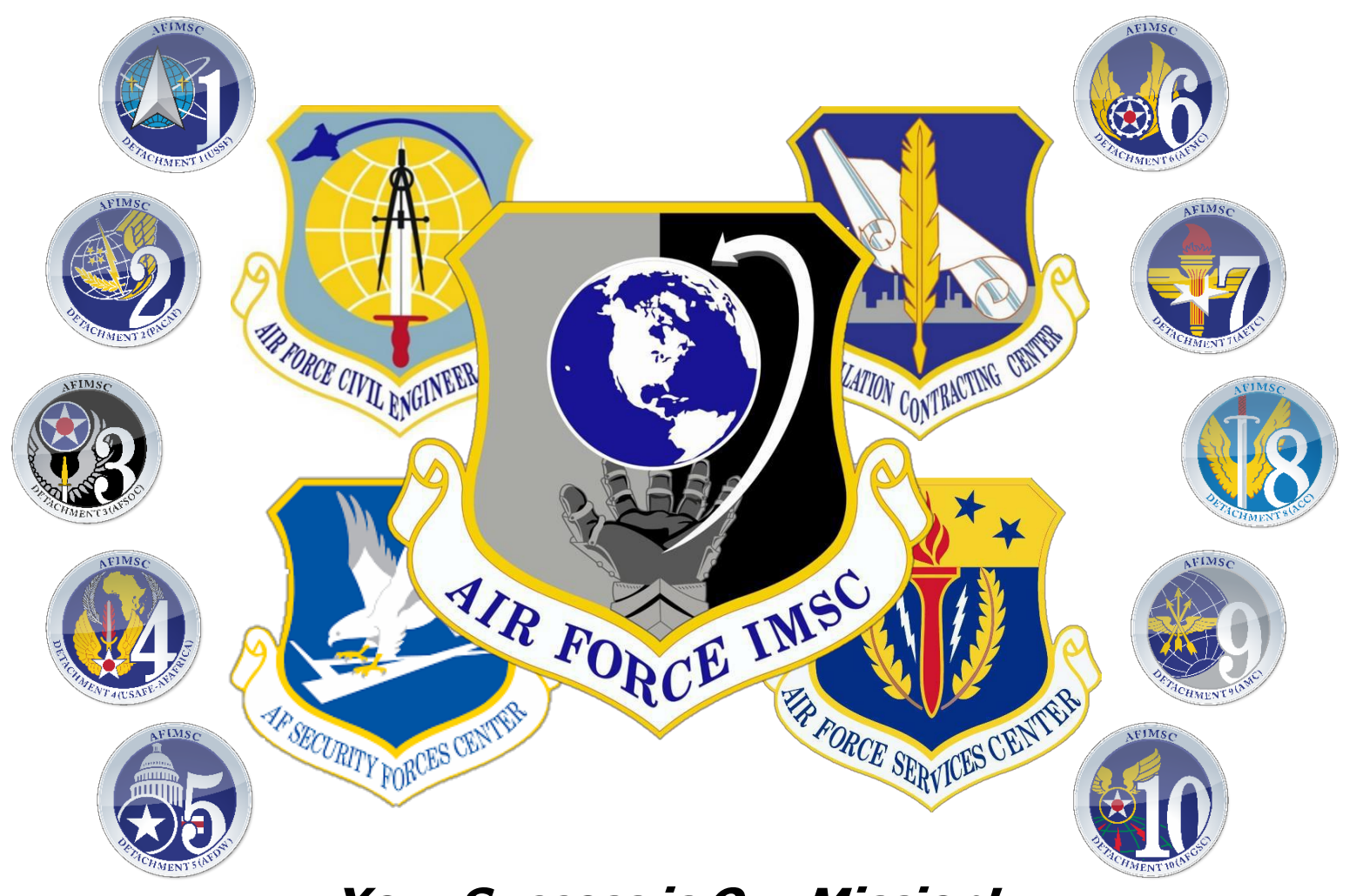
Your Success is Our Mission!